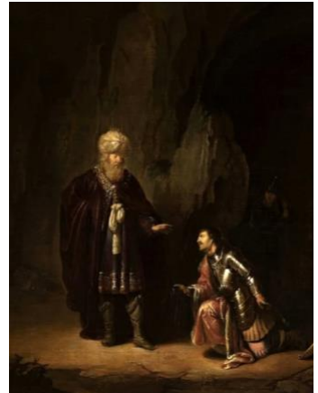
Saul and David in the Cave of En-Gedi by Willem de Poorter (1637)

Saul chased David through the Desert of En Gedi. David had the opportunity to take Saul's life but showed mercy to Saul as a gesture of good faith. The mercy of David softened Saul's heart, and the two men were temporarily reconciled.