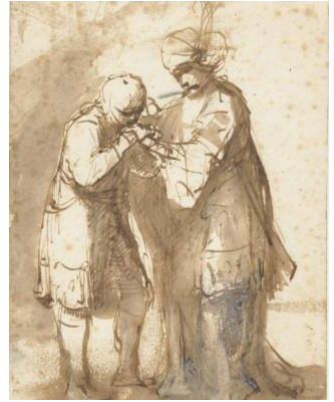
David and Jonathan by Rembrandt (1640)

After defeating Goliath in battle, David began serving King Saul as a soldier. David and Saul's son Jonathan became close friends during this time, both being renowned warriors with high integrity. As David's popularity increased, Saul's envy of him developed into hatred.