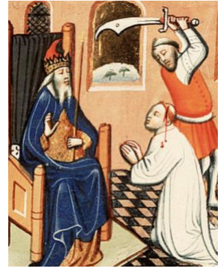
Doeg kills Ahimelek at the Behest of Saul by Masters of Otto van Moerdrecht - Manuscript (1430)

David fled from Saul and was sheltered by a group of priests, who provided food and weapons for him. When Saul heard about this, he ordered the priests to be killed. Most of Saul's attendants refused to raise a hand against the priests, but Doeg the Edomite obeyed, killing 85 priests and most of the villagers for sheltering David.