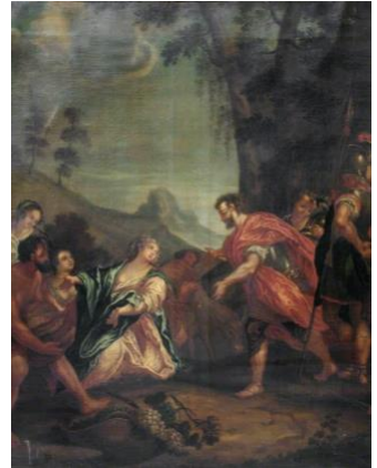
The Meeting of David and Abigail by Correggio (1489–1534)

David requested hospitality from Nabal, a wealthy shepherd that they'd defended from thieves. When Nabal insulted David and his men, David was angry and set out to take by force what Nabal should have given freely. Abigail, Nabal's wife, quickly intervened on her husband's behalf and as a result, Nabal is spared from David's wrath.