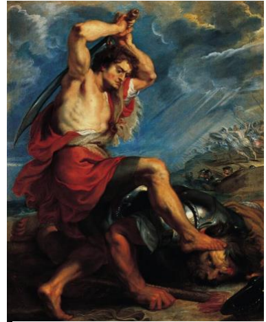
David Slaying Goliath by Peter Paul Rubens (1616)

Israel was at war with the Philistines, who had assembled an army near David's home. Goliath, the Philistine champion warrior, challenged Israel to send forward a champion of their own to face him in combat. Filled with fear, none of Israel's warriors would fight Goliath, but David remembered God's history of delivering his people from terrifying foes. David stood against Goliath armed only with a sling and defeated him.