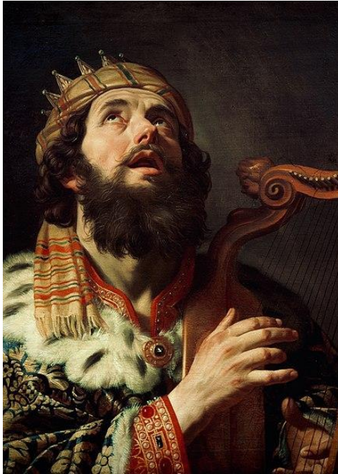
King David Playing the Harp by Gerard van Honthorst (1622)